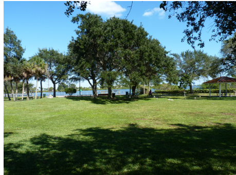
Beautiful Front Street Park.