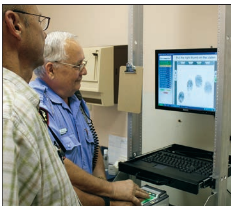
FINGERPRINTING is among jobs handled by Melbourne Police Department volunteers.

Costs are being controlled through measures including workforce reductions where possible. The City has continued a success-