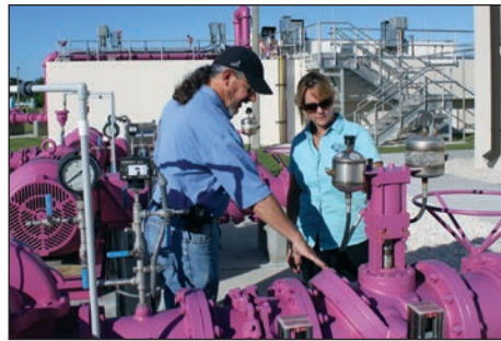
RECLAIMED WATER production facilities are being upgraded at two reclamation plants.

Staff documented a total of 47 businesses that furnished construction, technical, or