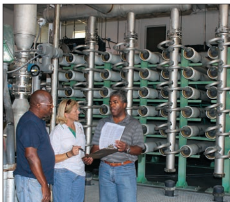
WATER PRODUCTION staff members were selected as Melbourne's water was selected as best in a regional competition. Pictured is the filter array that is involved in processing of well water.

For the 13th year, the City promoted water conservation by offering rebates to residents who installed low-flow toilets. Water conservation activities and environmental education initiatives undertaken by the City's Environmental Community Outreach Division earned two awards from the Florida