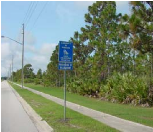
Sign placed on the right-of-way at Stack Boulevard acknowledging the Fountains of Melbourne for adopting a one-mile stretch.

The Melbourne Recycling and Sanitation Management Division's Adopt-a-Road program establishes a partnership between the City and its residents and business community. Together, the quality of Melbourne's environment and community is improved by keeping neighborhoods clean and free of debris.