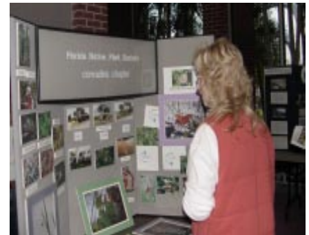
Attendee at last year's seminar looks at a display while on a break.

This free landscape seminar will be held on Saturday, Feb. 15 from 8:30 a.m. to 12:30 p.m. at Imperial's Hotel and Conference Center in Viera. Registration begins at 8 a.m.